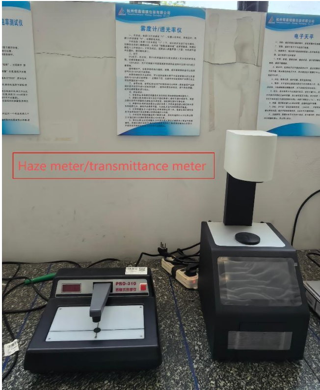
Haze meter/transmittance meter