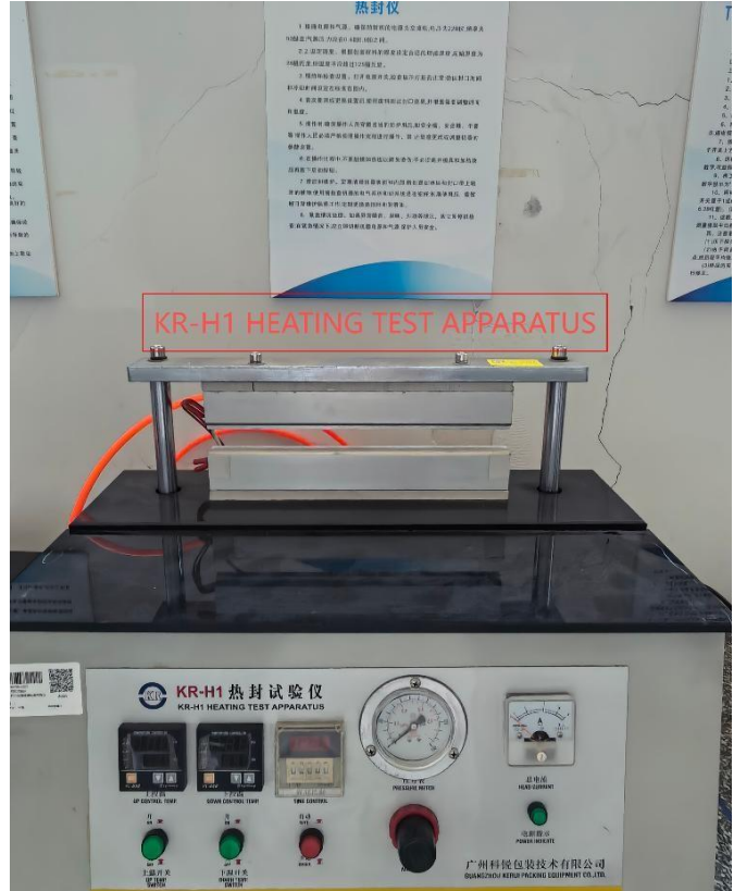
KR-H1 HEATING TEST APPARATUS